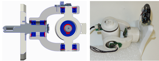
Figure 2. CAD design (left) and prototype (right) of the 3+1 DOF grip

The instruments are attached to the haptic device using a specifically designed grip (Fig. 2) that is manufactured using rapid prototyping techniques. The grip was engineered to be cheap, easily replacable and robust enough to withstand the forces that act at the instrument's tip. In order to derive the exact pose of the instruments, each joint is equipped with a position sensor. These are rotary magnetic position sensors from ams (AS5145 and AS5304), which use a hall sensor array to measure the orientation of a rotating magnet. In addition to the 3 translational DOF from the Falcon Device, the sensors add information about three rotational DOF of the instrument.