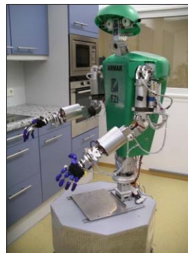
Fig. 1. Humanoid robot in the robot kitchen at the SFB 588 lab in Karlsruhe

Abstract —Future life pictures humans having intelligent humanoid robotic systems taking part in their everyday life. Thus researchers strive to supply robots with an adequate artificial intelligence in order to achieve a natural and intuitive interaction between human being and robotic system. Within the German Humanoid Project we focus on learning and cooperating multimodal robotic systems. In this paper we present a first cognitive architecture for our humanoid robot: The architecture is a mixture of a hierarchical three-layered form on the one hand and a composition of behaviour-specific modules on the other hand. Perception, learning, planning of actions, motor control, and human-like communication play an important role in the robotic system and are embedded step by step in our architecture.